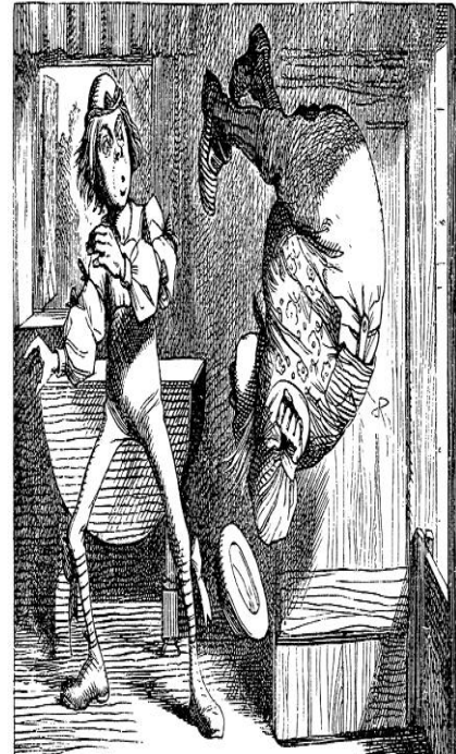
Illustration by John Tenniel