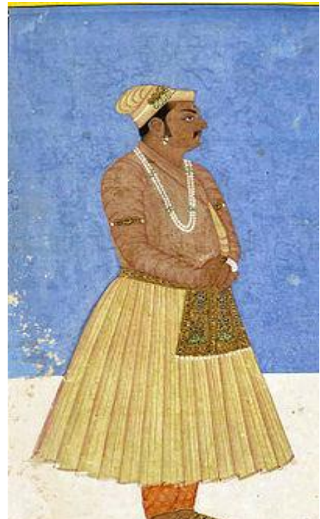
Birbal by Mughal Painter