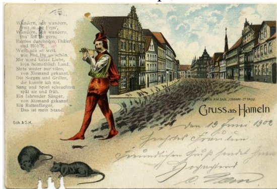
JOHANNI ET PAULI

Into the street the piper stepped, Smiling first a little smile, As if he knew what magic slept In his quiet pipe the while; Then, like a musical adept,